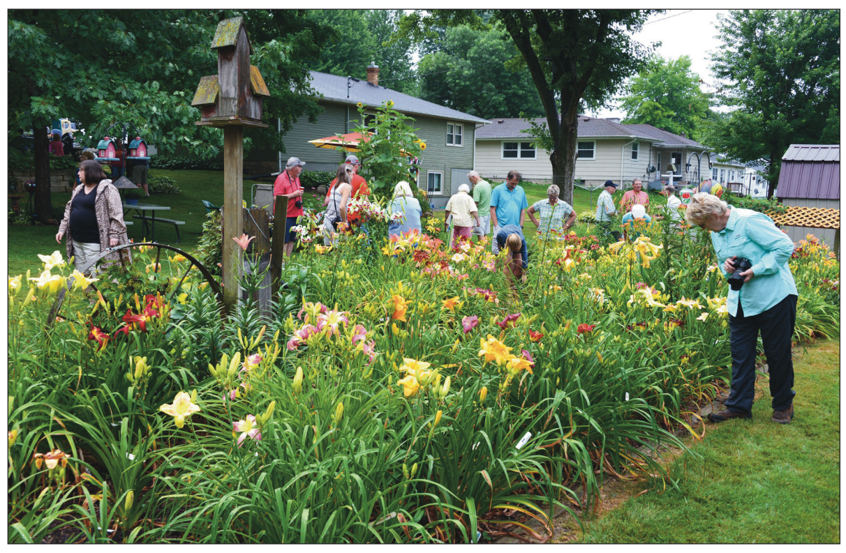
CVIDS members enjoy a visit to Diane Derganz's daylily garden. See CVIDS Club Report on next page.

Visit the ADS online Daylily Dictionary at https://daylilies.org/daylily-dictionary