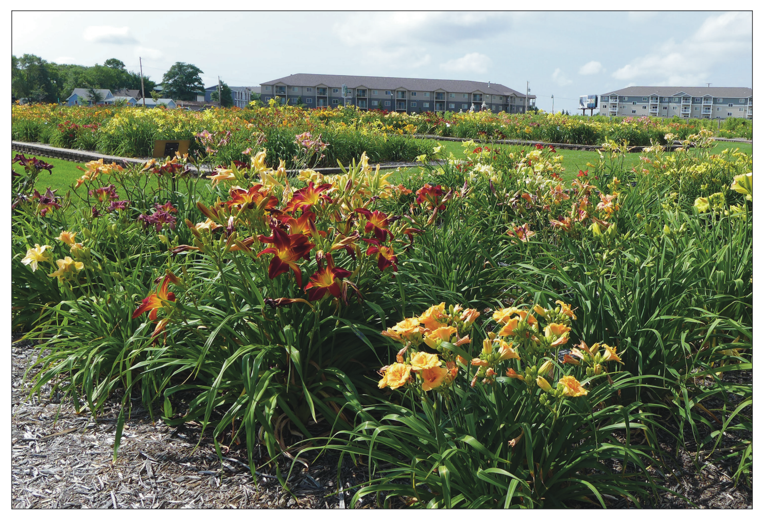
The Lenington beds at the Historic Daylily Garden, North Dakota State University (NDSU), Fargo ND.