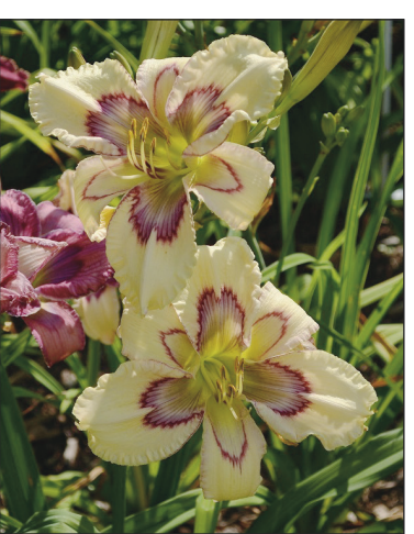
Right: One of 1,000 patterned seedlings that we will see in the Fass-Deemer garden in 2021.

Phil says he has promising future introductions: "One of my favorites is [(Lee Reinke x Skinwalker #1) x Isabelle Rose]. It has a magnificent scape, a big flower, good pollen, good foliage and increase, and is super pod-fertile. A hybridizer can't ask for much more. The flower has a lovely pink-lavender blush along the edges of the petals. 'Lee Reinke' and 'Isabelle Rose' both represent line breeding for whites, some of which goes back to the late 60s, so it should be great for large white flowers. But it should be excellent for long skinny whites as well."